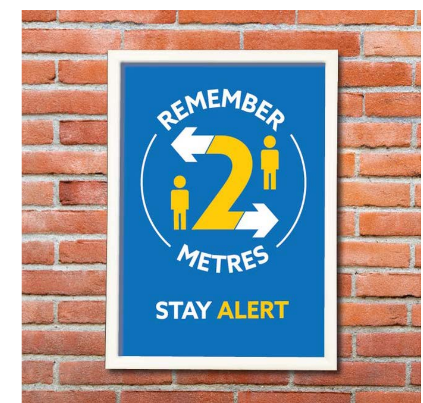
Wall Mounted Snap Frame A4 Size with Print / Frame £ 16.90 A3 Size with Print / Frame £ 19.90