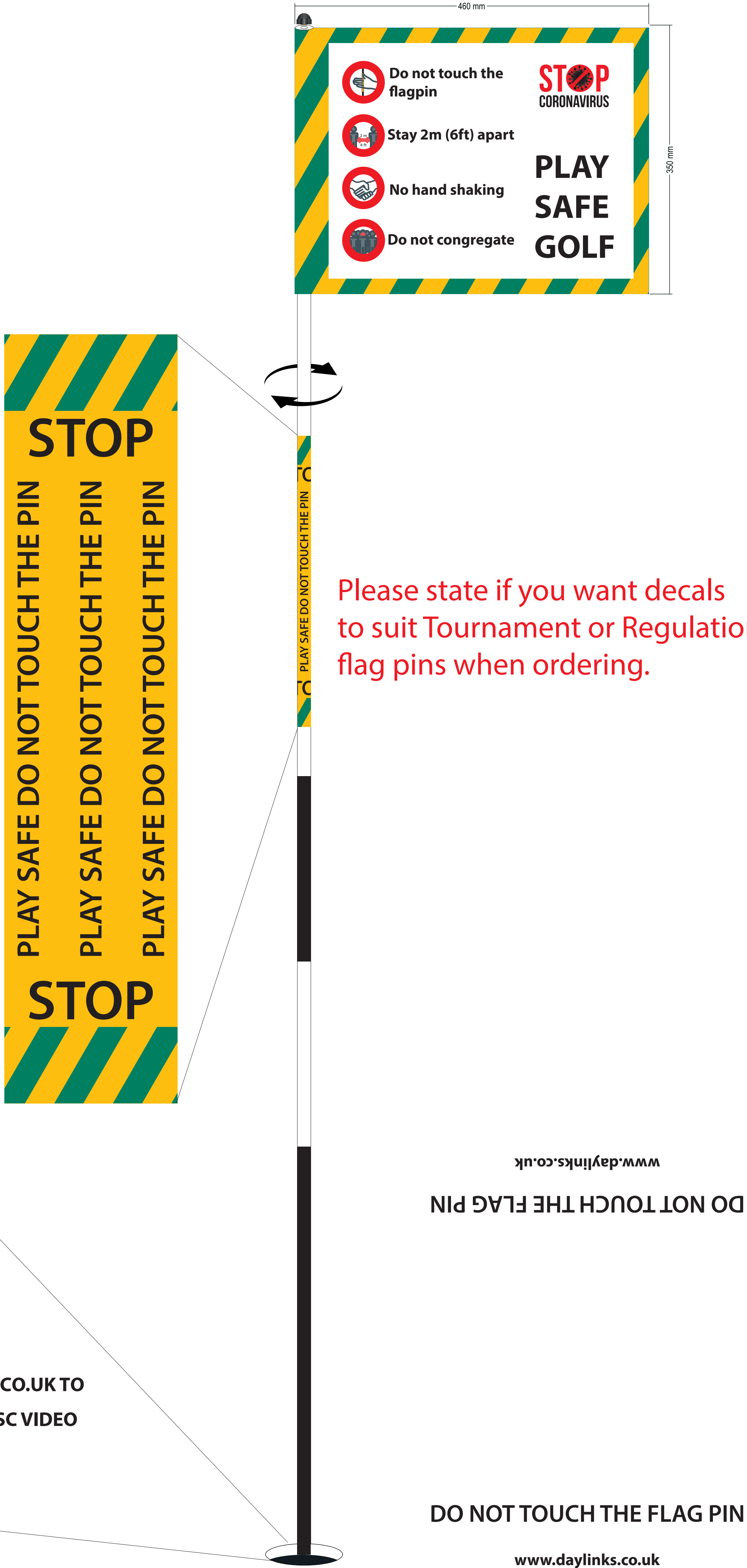
RRP £3.95 each

Please state if you want decals to suit Tournament or Regulation flag pins when ordering.