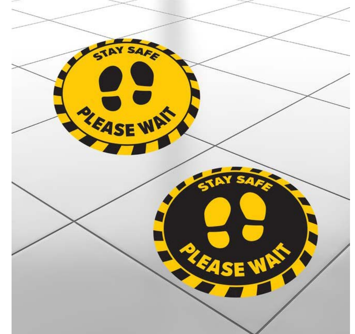
FLOOR MARKER NO 3 300mm x 300mm Easy Dot Vinyl Guard Material Set of 5 £59.00 Yellow with Black Text