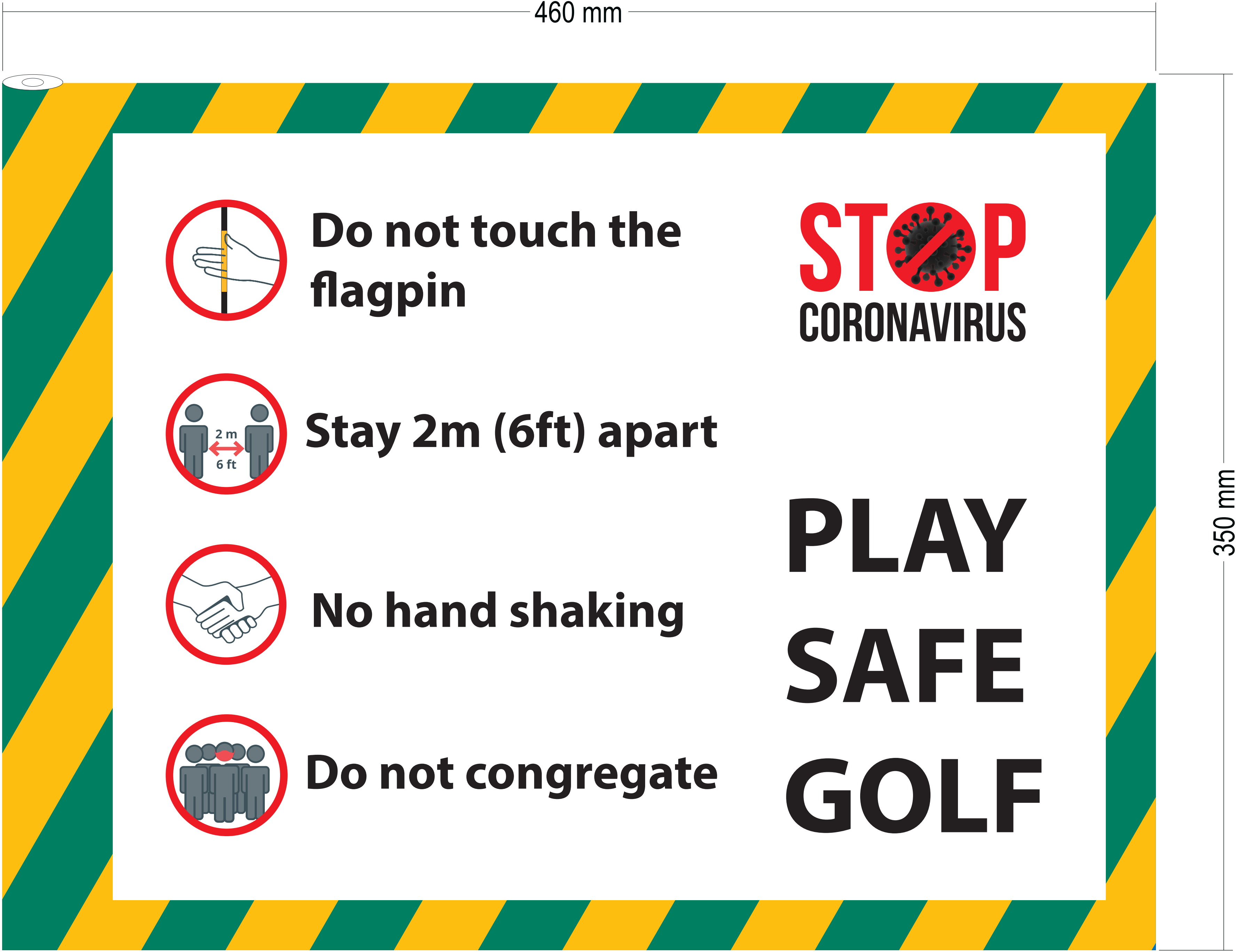
GF-DS-100-2 Two Ply doudle sided flag also available in tie or velcro fit option RRP £25.60 each