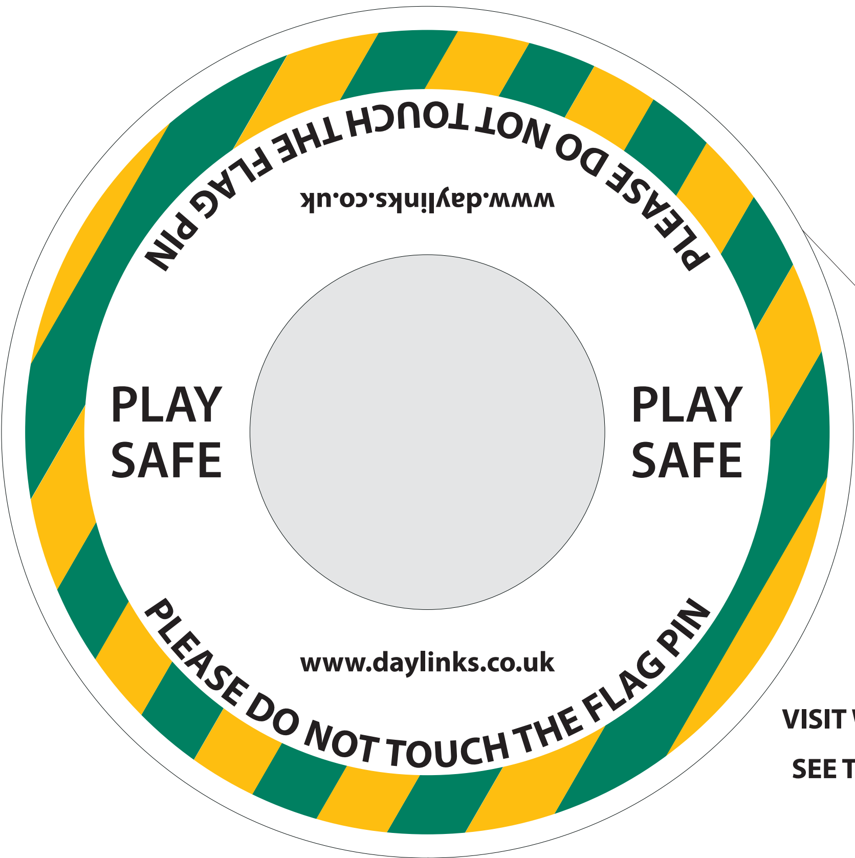
FP-19 Greens cup stay safe disc c/w S/A graphic and flag pin decal