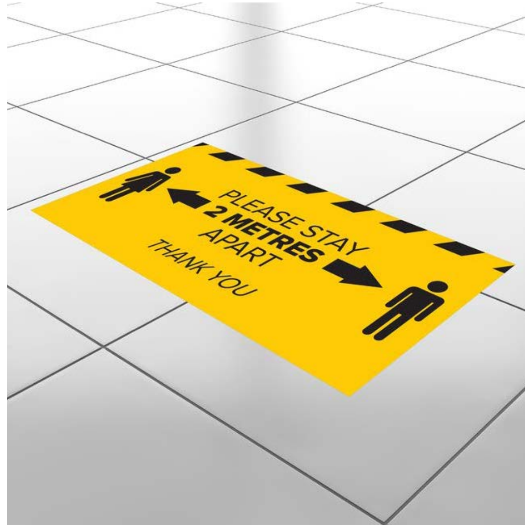
PLEASE STAY APART 1000mm x 500mm Easy Dot Vinyl Guard Material Set of 5 £95.00

WWW.DAYLINKS.CO.UK 07799 332295 mark@daylinks.co.uk