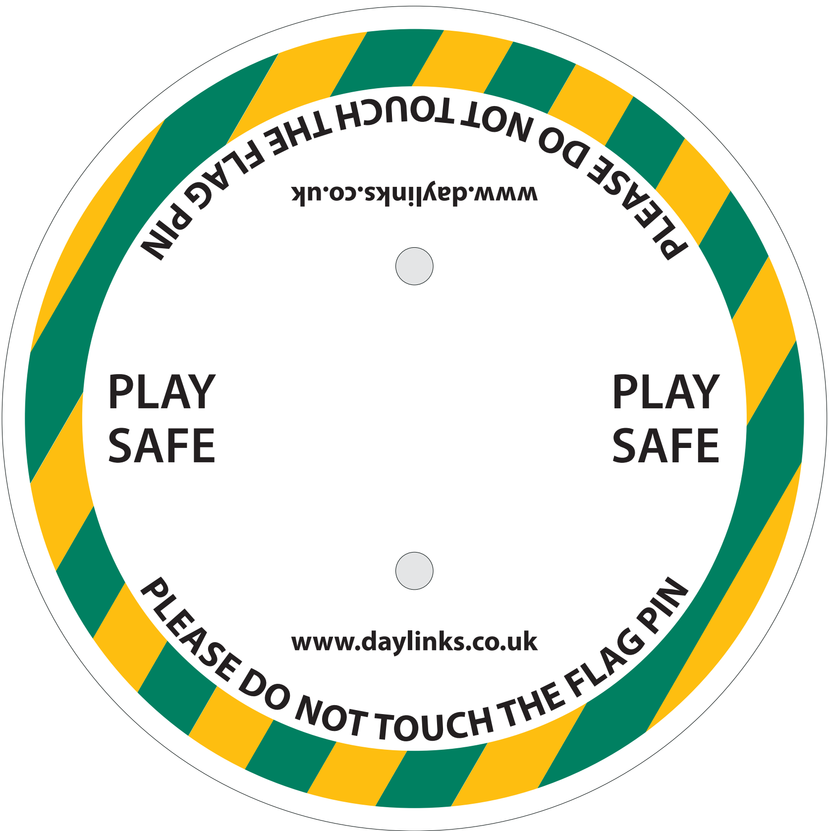
FP-20 Practice putting green stay safe disc. Can be numbered on Request. RRP £3.95 each