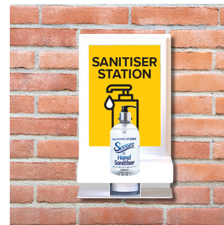
Wall Mounted Sanitiser Station 442mm x 262mm A4 Snap Frame for Club Updates £ 149.50

86cm Square Table Cover Only £ 125.00 6ft Table Cover Only £ 110.00 8ft Table Cover Only £ 135.00 Add £25.00 for Club Logo / Wording