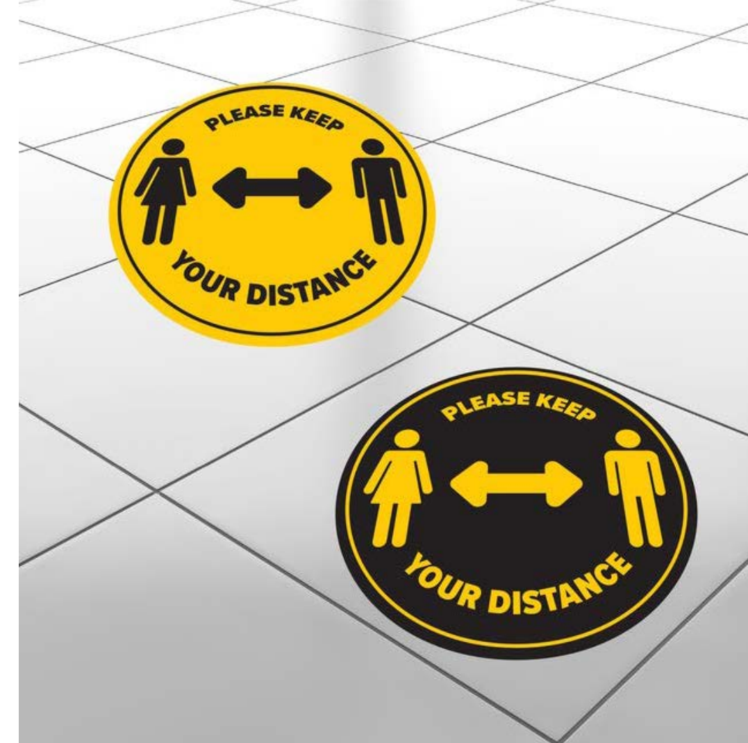
FLOOR MARKER NO 2 300mm x 300mm Easy Dot Vinyl Guard Material Set of 5 £59.00 Yellow with Black Text