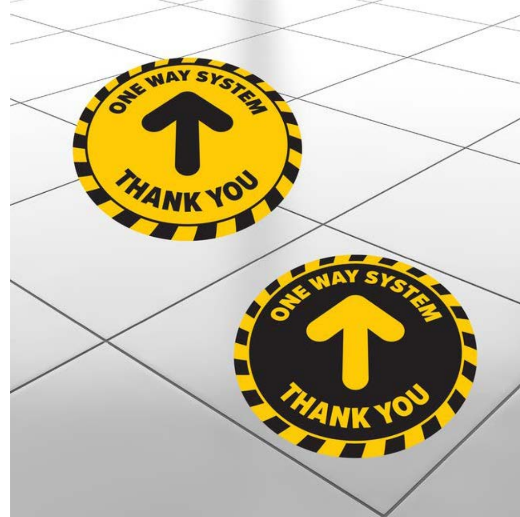
FLOOR MARKER NO 1 300mm x 300mm Easy Dot Vinyl Guard Material Set of 5 £59.00 Yellow with Black Text